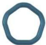
Apollo® SmartPress FKM -4°F to +392°F (446°F max)