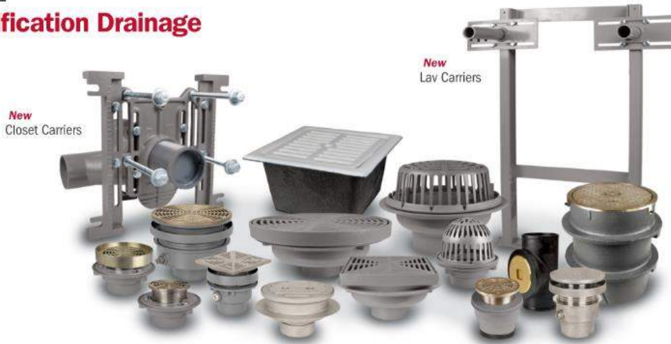
New Closet Carriers