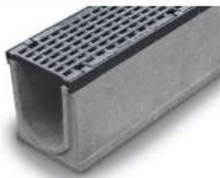
HydroTec™ Heavy-Duty Concrete Channel - Integral Edge Rails