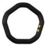
Apollo® SmartPress HNBR -22°F to +212°F (230°F max)

All Apollo® SmartPress products come equipped with a patented 'smart' sealing element. The special geometry creates both a grip function to prevent fitting from falling off pipe, as well as immediate tactile detection of the sealing element upon pipe insertion. In addition to this, the sealing element incorporates built-in Leak Before Press® technology and is manufactured and assembled within a silicone-free production process.