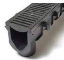
FastTrack™ Pre-Sloped, HDPE Trench Drain System