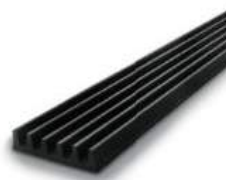
HydroLine™ Low-Profile, Surface Water Control System