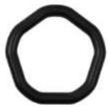
Apollo® SmartPress EPDM -31°F to +275°F (302°F max)