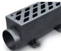
HydroBlock™ One-Piece, Ductile Iron Channel/Grate System